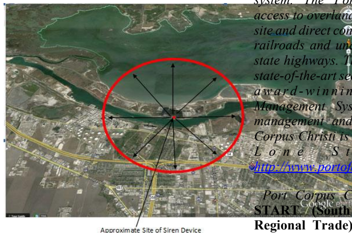
Approximate Site of Siren Device

The siren/alarm will be of that volume that it may be heard anywhere within the red circle shown in the above Illustration.