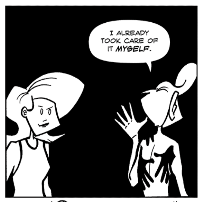
6 O2013 PATRICK ScullIN