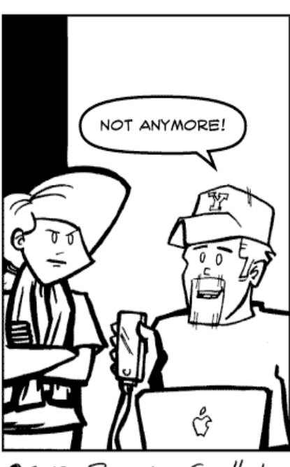
5 02013 PATRICK ScullIN